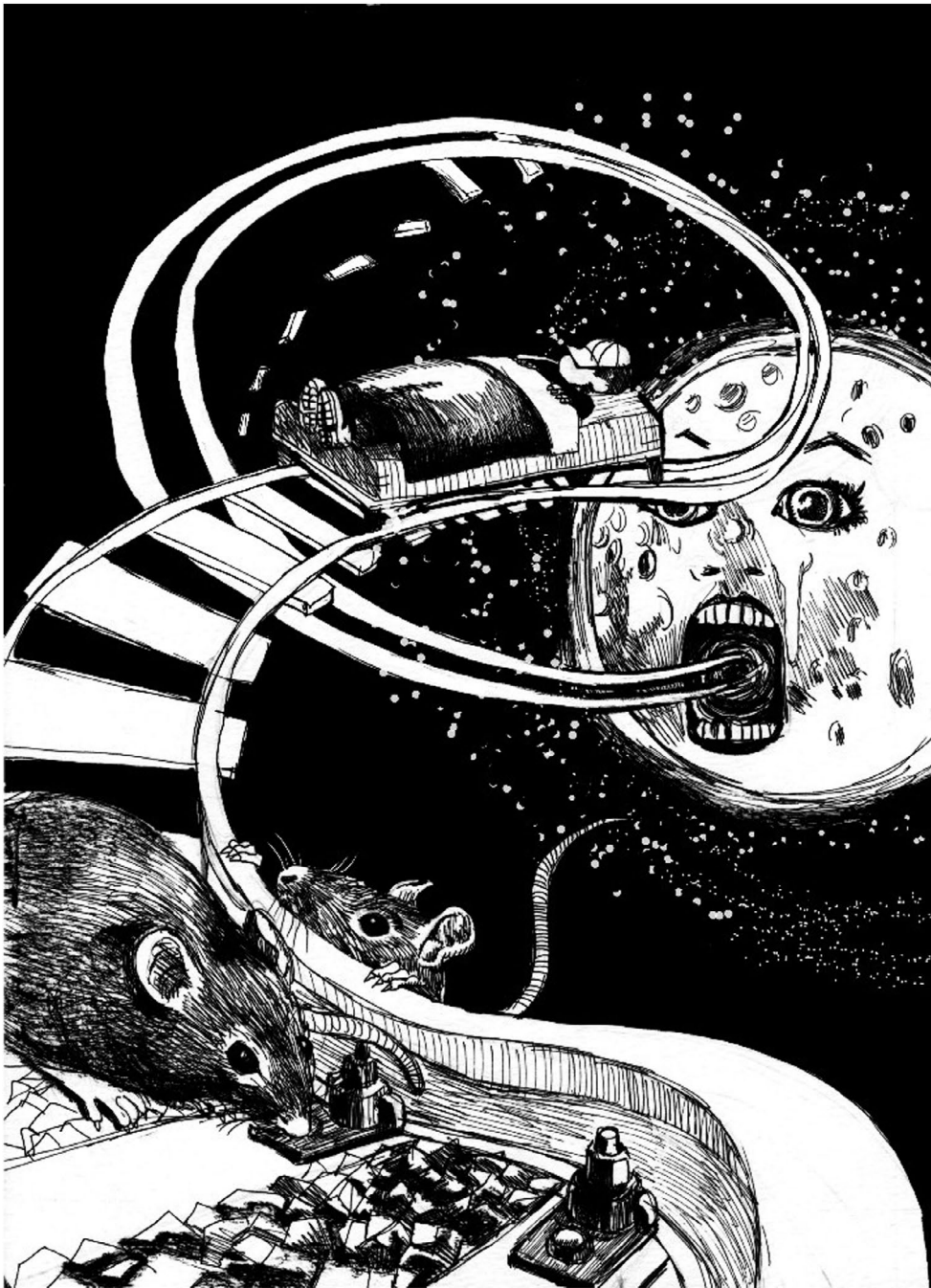
Figure 2. Sleeping in the train station. Source: Illustration by Eleonora Mignoli.