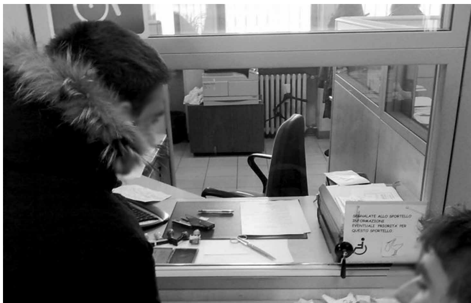
Figure 2 Two young homeless individuals waiting to be served at one of the city's offices

In the end, the 'Via della Casa Comunale, 1' policy was proposing to the individual a standardised and monolithic procedure without being able to take into account one's own specific matters (as with Daniele's old car issue or Giuseppe's wish to work), thus embroiling the subject into a powerful, highly binding and conditioning, assemblage-bureaucracy.