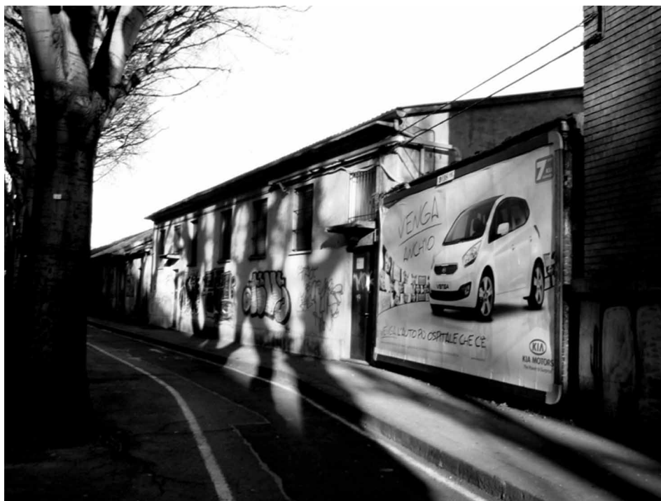
Figure 4 The entrance to the 'via Sacchi' multifunctional centre

individual with a history of behavioural problems, were going to the centre every day at 4 p.m., and staying there for at least a couple of hours chatting and enjoying a space that they perceived as 'OK' (Valerio, Mar. 2010).