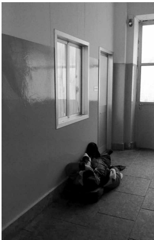
Figure 1 Homeless person resting in the premises of the Vincenziani soup kitchen. 'When you miss the 1 + 1 you won't sleep. So what do you do? You try to survive until the morning. And then you sleep wherever you can' (Silvano, Oct. 2009)

In getting closer to the assemblages forming the '1 + 1' one could better appreciate the implication of this policy on its recipients. Some of the people I encountered were purposively refusing to engage with this system because they perceived it as denigrating. Ivano was one of them: