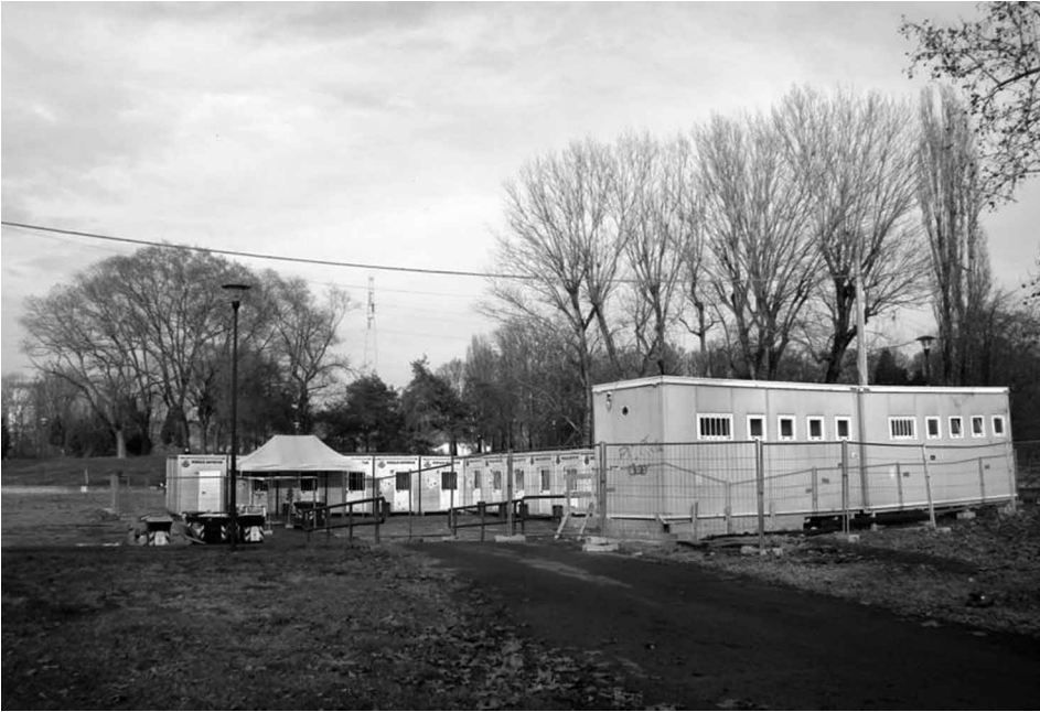
Figure 3 The 'Emergenza Freddo' camp

'Service staff must register the guests asking them their generalities: Name—Surname—Nationality—Sex (it is not necessary to ask for any Identity Document, as this area [the Camp] is recognized as "free zone" unlike all the other dormitories of the city).' (Croce Rossa Italiana 2008)