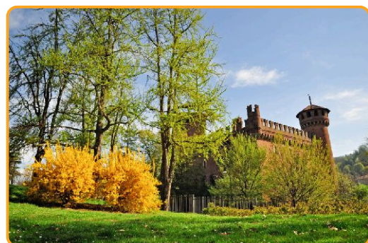
A view of the Valentino Park

The Università degli Studi di Torino and Politecnico di Torino are top Italian and European universities. Together, they offer state-of-the-art facilities hosting more than 100,000 students from all over the world. Students will attend lecture in our Departments, near the Valentino's Park in the city centre of Turin.